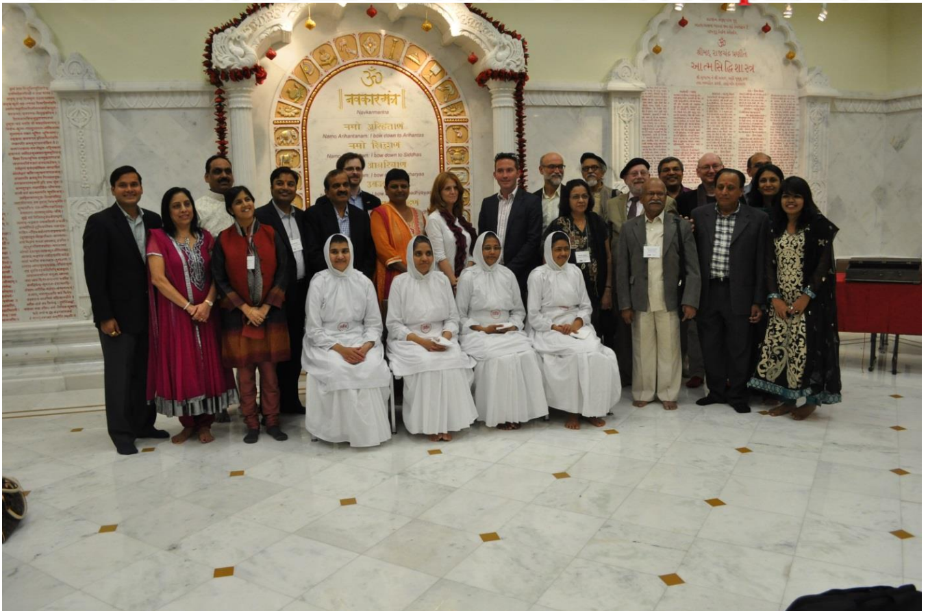
A Scholars Team of Presenters