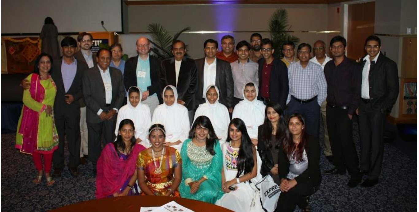
A dedicated JERF Team of Accomplishers